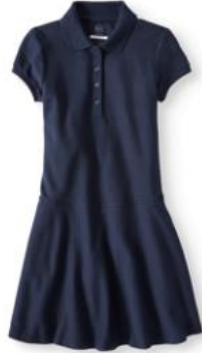
Polo Dress in NAVY ONLY

LP Logo not required on polo dresses or rompers. No name brand logos visible on polo dresses or rompers.