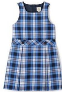
Jumpers (must wear Red's light blue or navy logoed polo underneath). White blouses/polos not permitted.