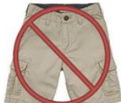
No Cargo Pants or Shorts