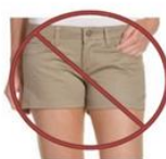
No Jean Style Pockets with Rivets or Shorts Too Short