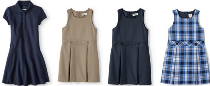
Polo Dress in NAVY ONLY

LP Logo not required on polo dresses or rompers. No name brand logos visible on polo dresses or rompers.