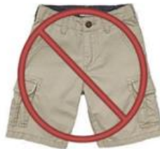
No Cargo Pants or Shorts