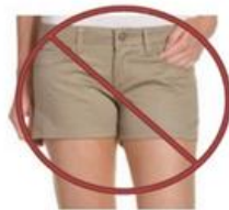
No Jean Style Pockets with Rivets or Shorts Too Short