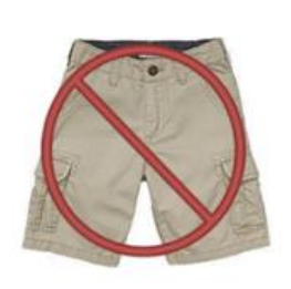
No Cargo Pants or Shorts