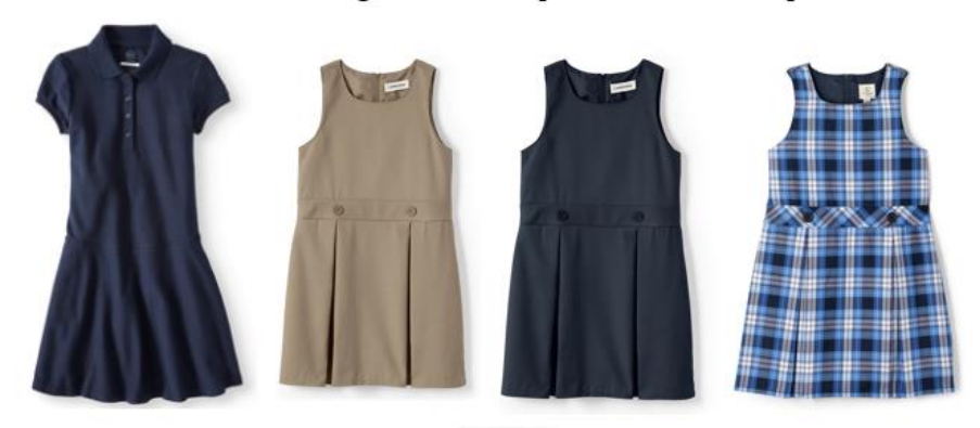
Polo Dress in NAVY ONLY

LP Logo not required on polo dresses or rompers. No name brand logos visible on polo dresses or rompers.